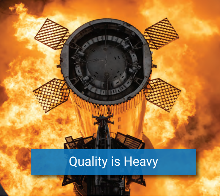
Quality is Heavy