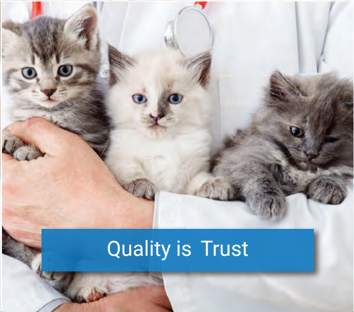
Quality is Trust