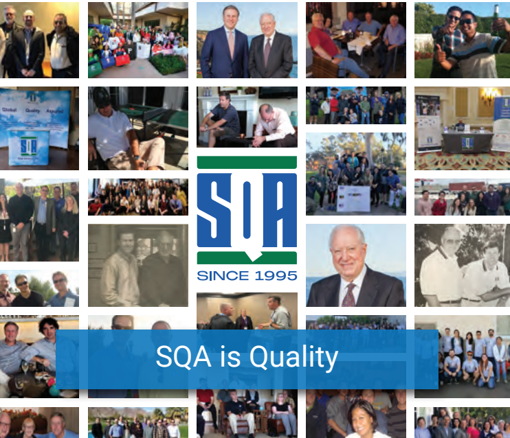
SQA is Quality