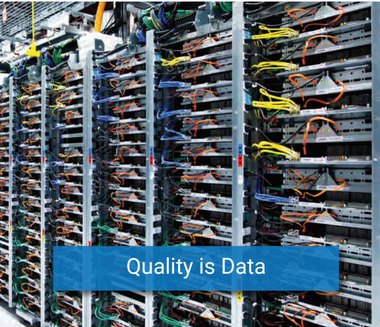
Quality is Data