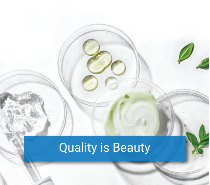
Quality is Beauty